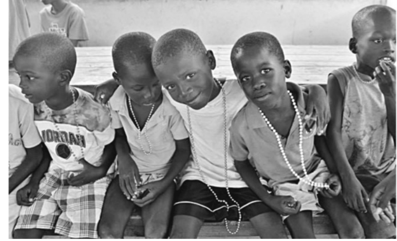
Kids like these will receive backpacks filled with school supplies thanks to the money our All Stars players will raise during VBS this week. You can help too!

We'll keep track of how much cash each team collects each day and let everyone know who's leading. At the end of the week, the team that has